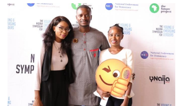
Participants at the symposium