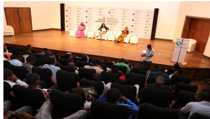
Cross-section of participants at the symposium