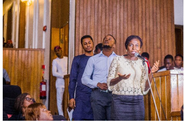
Q & A sessions with the participants