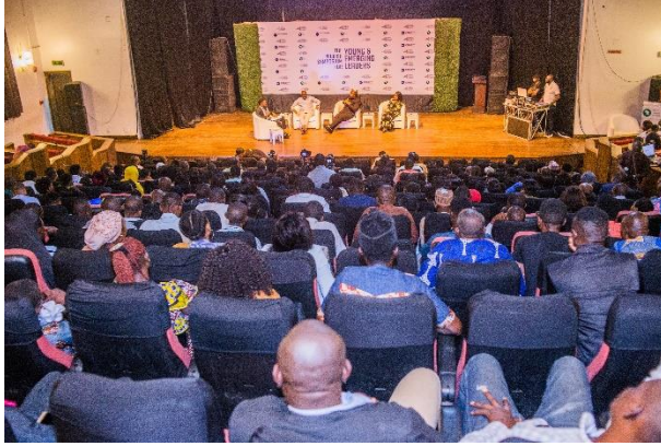
Cross-section of participants at the symposium