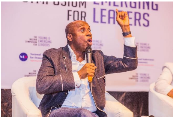
Hon. Rotimi Amaechi, Minister for transportation

Consequently, The Future Project hosted its fifth edition of the symposium, held on Friday, July 12, 2019, with the theme, 'Turning the Curve: Aligning Government Policy to Citizens Realities'. The objective of this edition was to lead a new conversation on government performance and citizens' social reality. The event further complemented the media advocacy on www.YMonitor.org , which is directed at active citizenship and responsible governance. The dialogue entailed a new direction tailored towards local relevance and global competitiveness for young and emerging leaders.